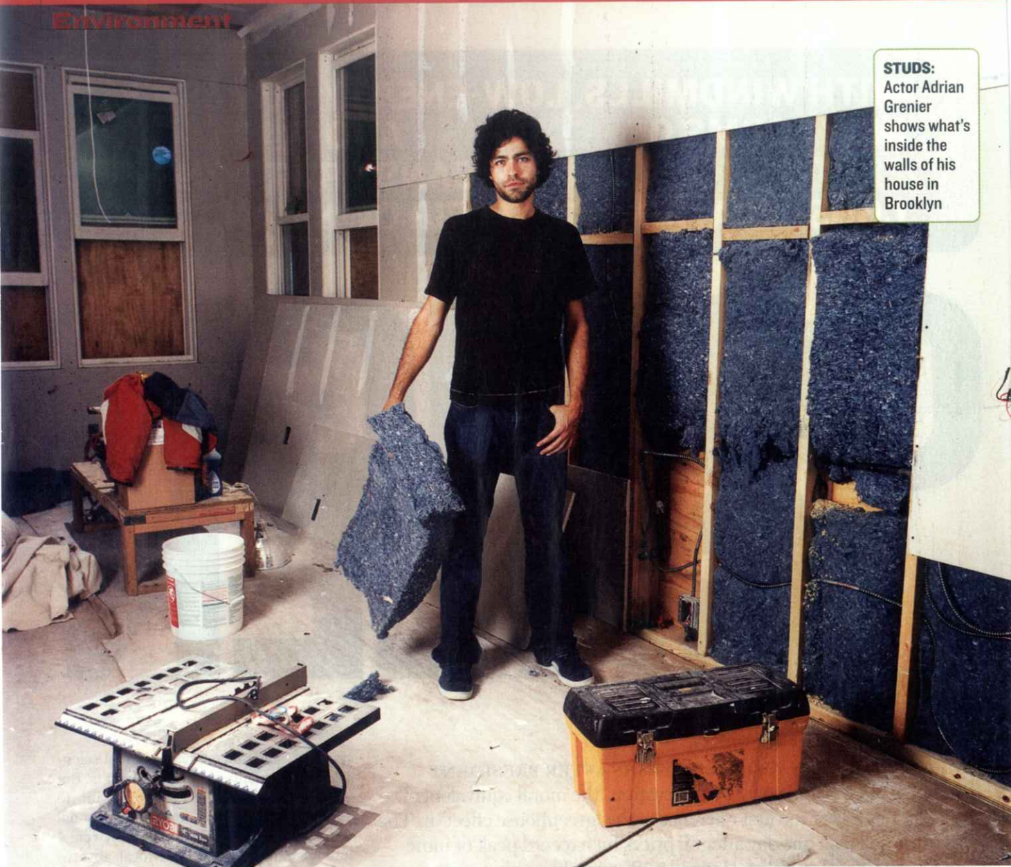
STUDS: Actor Adrian Grenier shows what's inside the walls of his house in Brooklyn