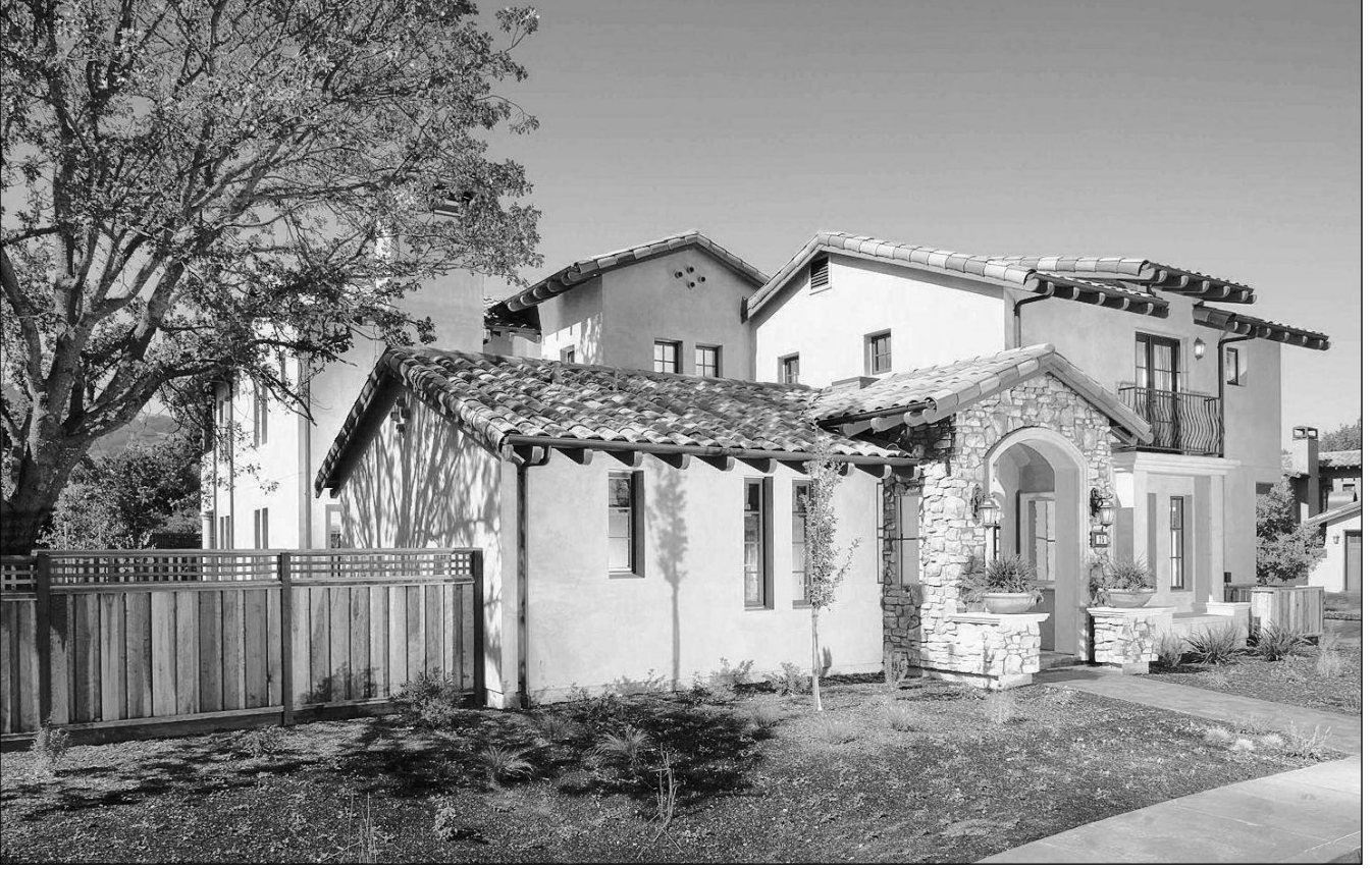
LOCATED IN THE HEART OF DANVILLE, and nestled against the Iron Horse Trail, Hansen Lane Estates is a private enclave of spectacular executive-style homes in an established, desirable neighborhood.

Sharp Electronics Corporation is the U.S. subsidiary of Japan's Sharp Corporation, a worldwide developer of oneof-a-kind home entertainment products, appliances, networked multifunctional office solutions, solar energy solutions and mobile communication and information tools. Leading brands include AQUOS Liquid Crystal Televisions, 1-Bit digital audio products, SharpVision projection products, Insight Microwave Drawer appliances, Plasmacluster air purifiers, and Notevision multimedia projectors. For more information visit Sharp Electronics Corporation at www.sharpusa.com